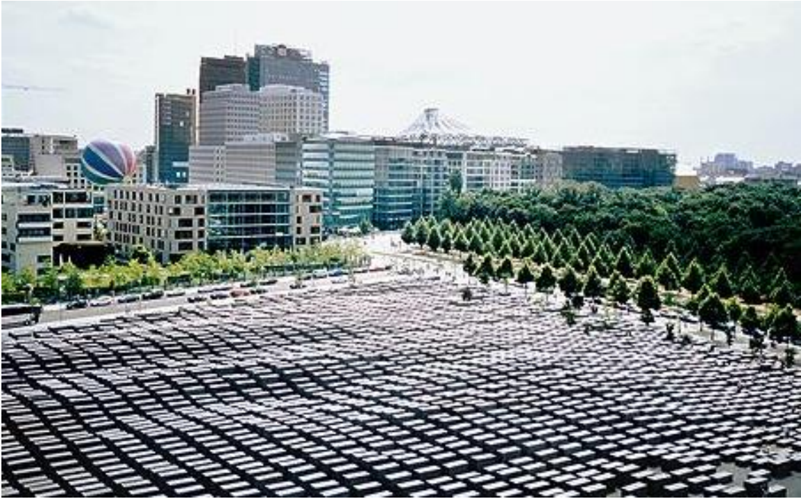
Memorial to the Murdered Jews of Europe, Berlin, Germany, 2005