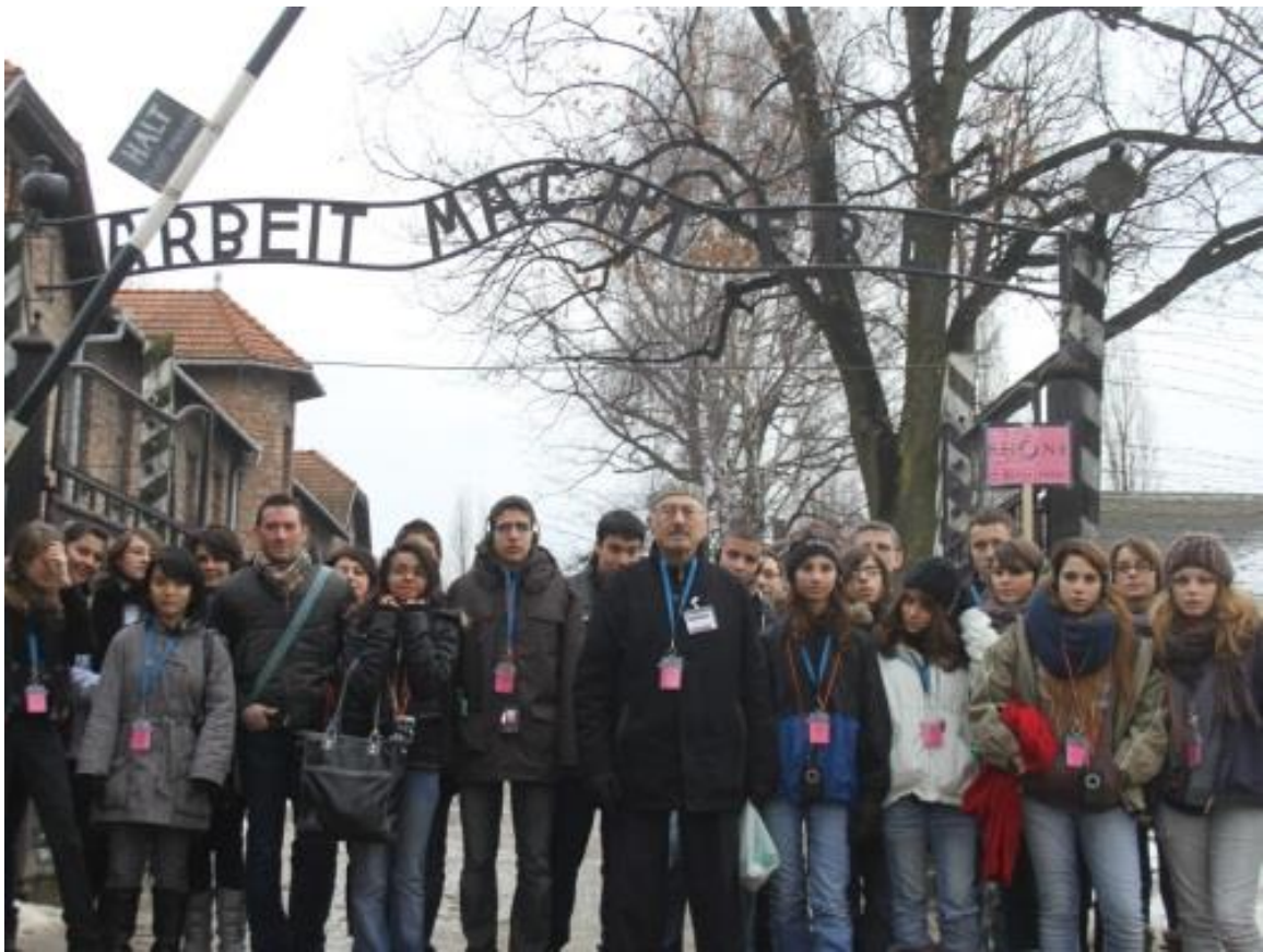
Youths at Auschwitz Memorial Museum, Poland

During the Khmer Rouge's brutal reign in Cambodia during the mid-to-late 1970s, a former math teacher named Duch served as the commandant of the S-21 security center, where as many as 20,000 victims were interrogated, tortured, and executed. In 2009 Duch stood trial at the UN-backed Khmer Rouge Tribunal for these crimes against humanity. While the prosecution painted Duch as evil, his defense lawyers claimed he simply followed orders. This was just one of several parallels between the Duch trial at the Khmer Rouge Tribunal and the Eichmann trial. This talk will discuss Duch's trial and how it might help us reconsider Arendt's notion of the banality of evil in terms of "the banality of everyday thought."