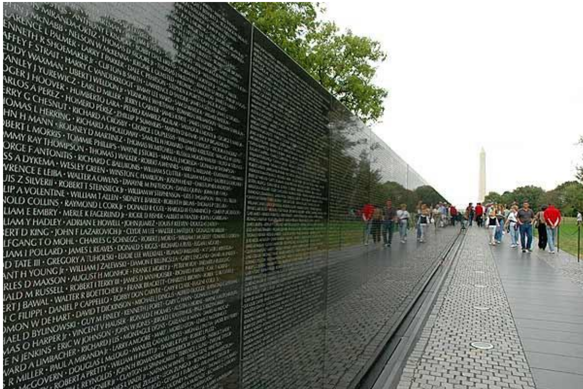
Vietnam Veterans Memorial, Washington, D.C., USA

Undergraduate research papers are based on (and use intensely) at least one scholarly book and one scholarly articles in addition to those mentioned in this syllabus. Graduate and capstone papers include at least four scholarly books and six scholarly articles; those listed below as required readings do not count. Instead of a book you can choose three articles. Newspaper articles and alike, and internet sources other than accessible through Goddard do not count as scholarly literature. (You may still use and quote them.) A one-page outline of the paper and a preliminary bibliography is due electronically (to the email of the instructor) by Nov 15 . Originality, thoughtfulness, and organization of your thoughts are appreciated, as is the proper citation of your references and sources. If you are not familiar with how to write and submit such a paper, you may wish to consult J. R. Benjamin, A Student's Guide to History (10 th ed., Boston, 2007) or Ch. Lipson, How to Write a BA Thesis (Chicago, 2005). They offer valuable assistance, not least regarding the formal shape of your paper.