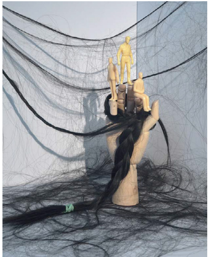
She Dreamed a Dream , Digital Inkjet Print, 19"x13", 2020. Xuemeng Zhang