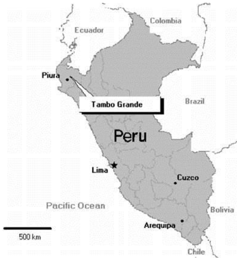
Figure 2: Site of Manhattan Minerals' Tambogrande Mine