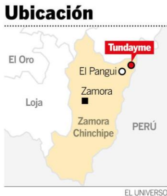
Figure 2. Map Zamora Chinchipe- Tundayme (El Universo, 2014)