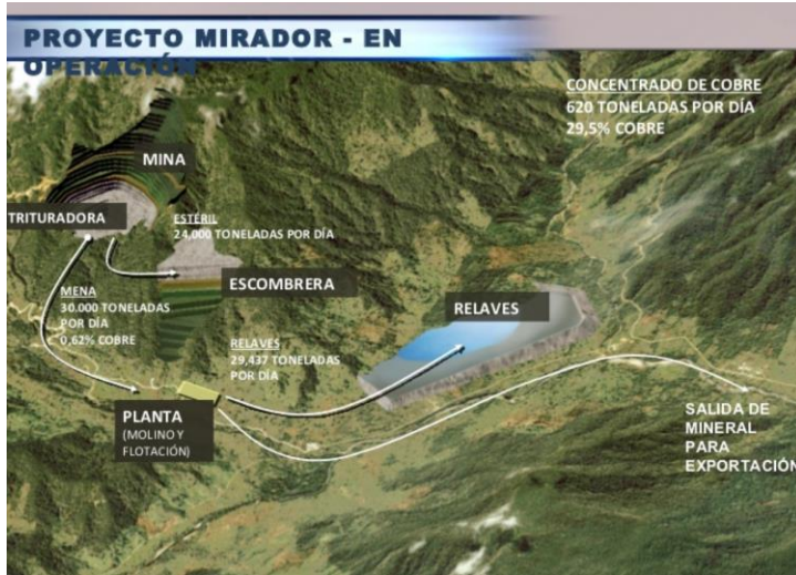
Figure 3. Map of Tundayme once Mining Operations Begin (Presidencia del Ecuador 2009)

outsiders was the beginning of vast change that has only been magnified by the arrival of mining.