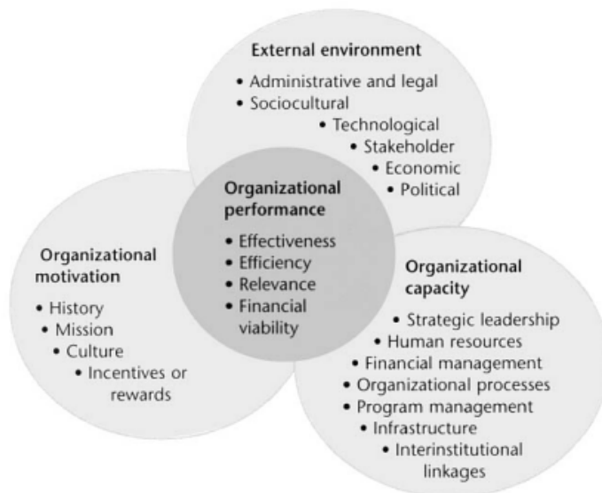
Figure 1 Lusthaus, Charles "organizational Assessment: A Framework for Improvng Performance" 2002.