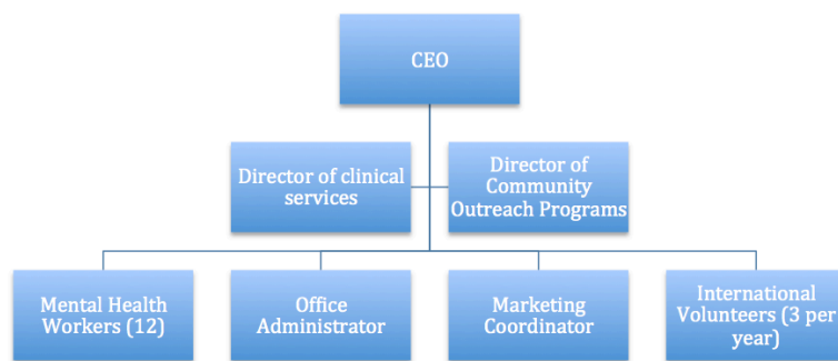
Figure 2 Asirans Organizational Structure (Note that some roles are filled by the same people. For example, the director of clinical services is the CEO).

The official vision of Asirans is “finding hope, strength, and peace of mind”, and the mission is, “Dedicated to strengthening the mental health and well-being of individuals, families, and communities in Haiti through counseling, advocacy and education.” The whole team displays personal motivation to help improve the lives of others through strengthening their mental health. The staff is eager for the opportunity to practice what they have learned in university or in the Asirans certificate classes. For a detailed overview of my assessment of Asirans over 6 key indexes as seen in the CARE Framework, please refer to the appendix (Asirans ICAF).