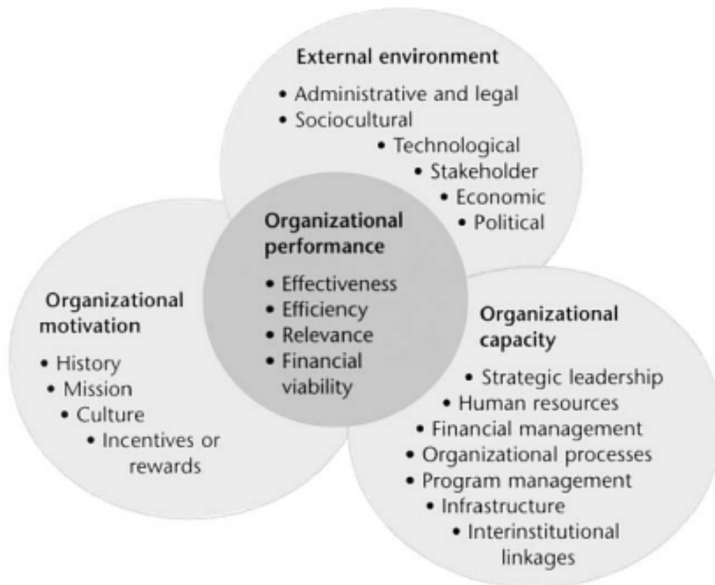
Figure 6 Lusthaus, Charles. Assessing organizational Capacity 2002.