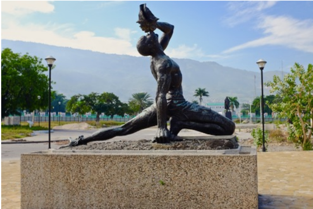
Figure 7 Photo credit Georgianne Nienbar 2015.