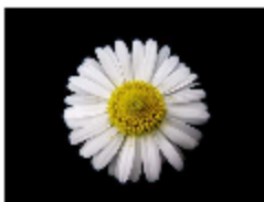
Photo from The Great Gatsby

Daisy is a woman who is torn between her love for Gatsby and her loyalty to Tom. She is a woman who is caught in a love triangle, and her choices ultimately determine the fate of the novel.