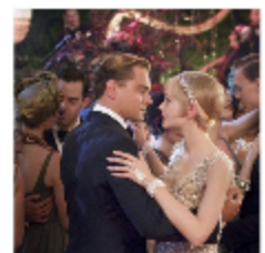
Photo from The Great Gatsby