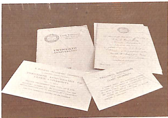
4. Programs, invitations and other memorabilia for the Clark University Twentieth Anniversary celebration. The printed program includes the schedule for the Freud and Jung lectures. The items can be found in the Clark University Archives.