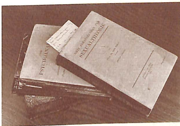
5. From the Goddard Library's Hall collection: Drei Ahandlungen zur Sexualtheorie with its original Clark University library card noting President G. Stanley Hall ("G.S.H.") as the first reader; a rare first edition of Freud's Clark lectures, The Origin and Development of Psychoanalysis ; two copies of Zur Auffassung der Aphasien von Dr. Sigm. Freud Leipzig und Wien, 1891—G. Stanley Hall's signature and book plate are on the front end paper of one copy.