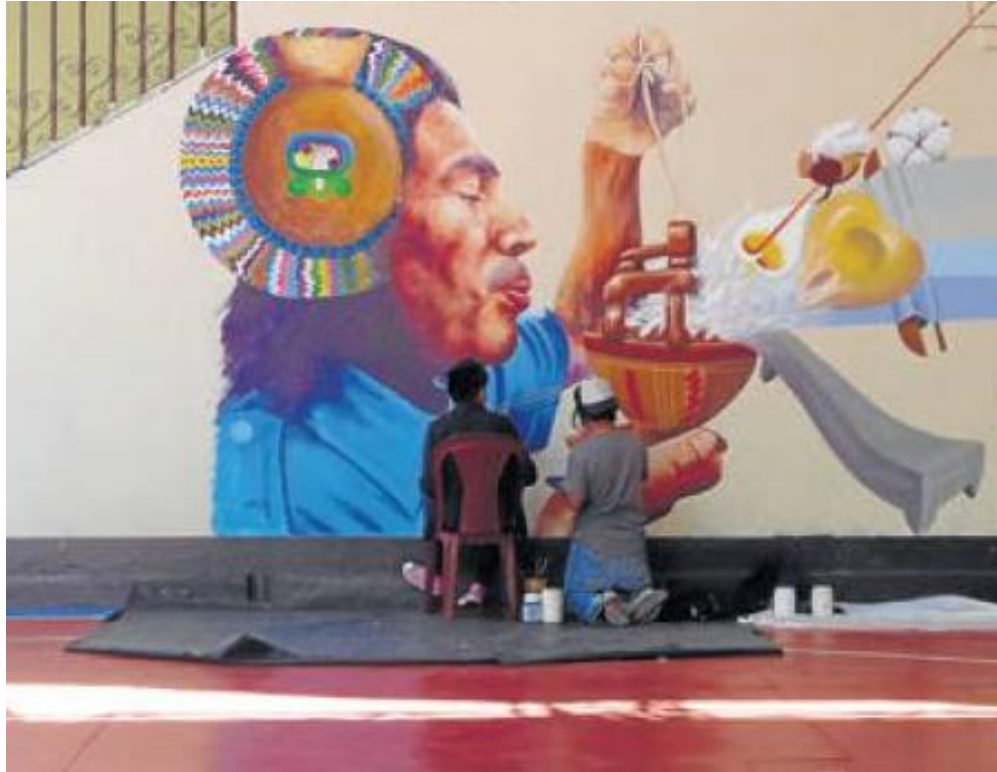
Figure 3: Mural titled Weaving Our History

climate change and genetically modified crops. The group worked together to paint the 40-meter long mural titled “Weaving Our History” (See figure 3). They are proud to be dedicated to painting to explore cultural identity and earn an economic identity from it.