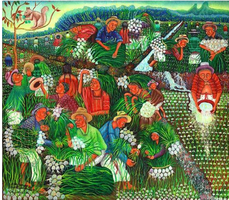
Figure 2: Victor Vasquez Temo - Harvesting and Maintaining Onions

The paintings play two roles: to document parts of their culture that make them unique and to earn money to support their families. As one painter told me: