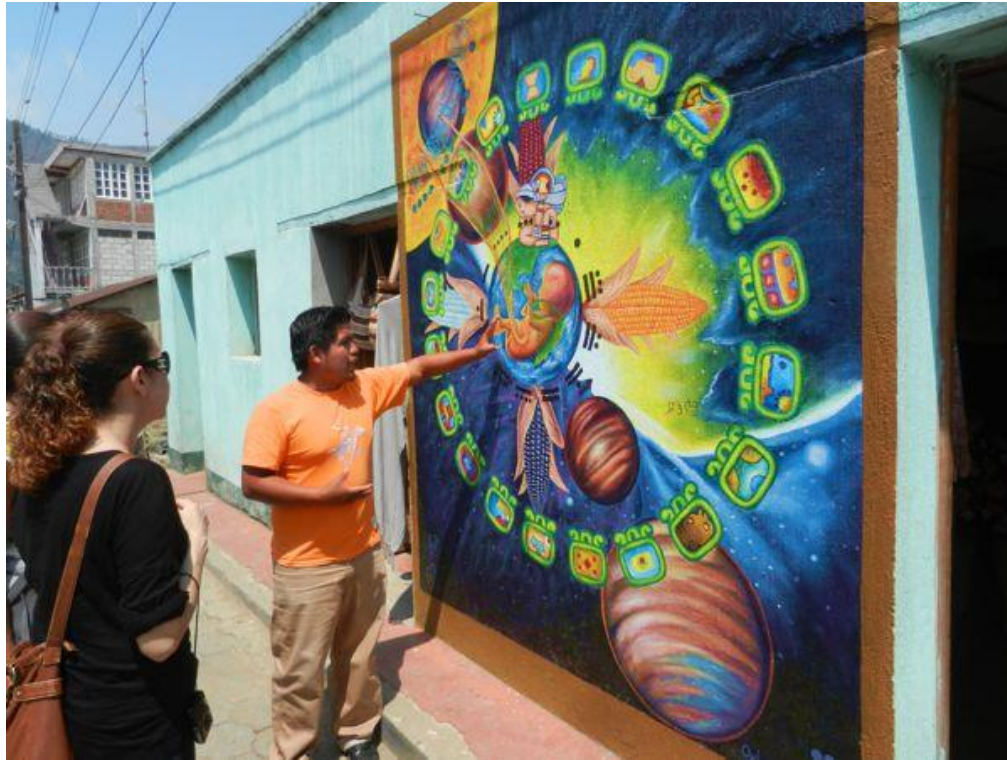
Figure 4: Tour guide showing Mayan calendar mural to tourists

Therefore, the murals are created for both tourists and locals. Instead of the paintings that stay in the art galleries or are sold to tourists, the murals stay in town and decorate buildings. During the course of my interviews, I entered two homes that had murals inside their homes. In addition, in the interview with the Coordinator of the Municipal Tourism Office, I saw photographs of every mural in town decorating his office. This demonstrates that some Juaneros are also proud of them.